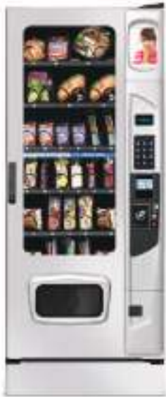
Shown with platinum door and kick panel options.