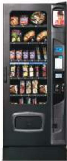
Shown in black with iCart touch screen and kick panel options.