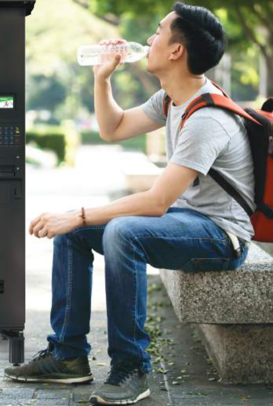
Evoke Outdoor (ST)

The refrigerated merchandiser designed for performance and built to last