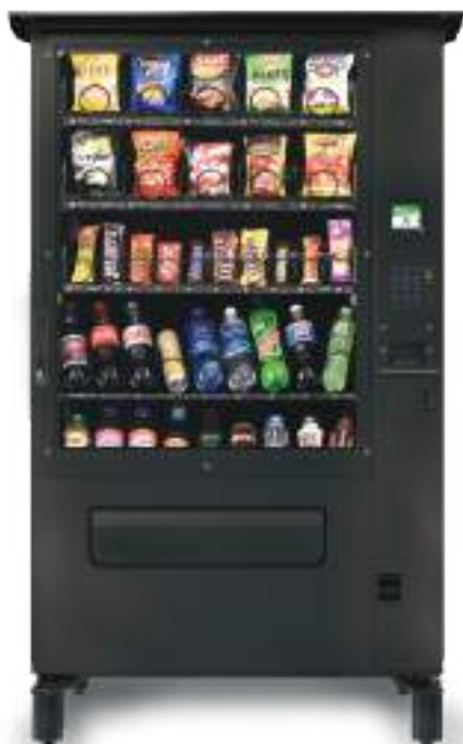
Evoke Outdoor (VT)