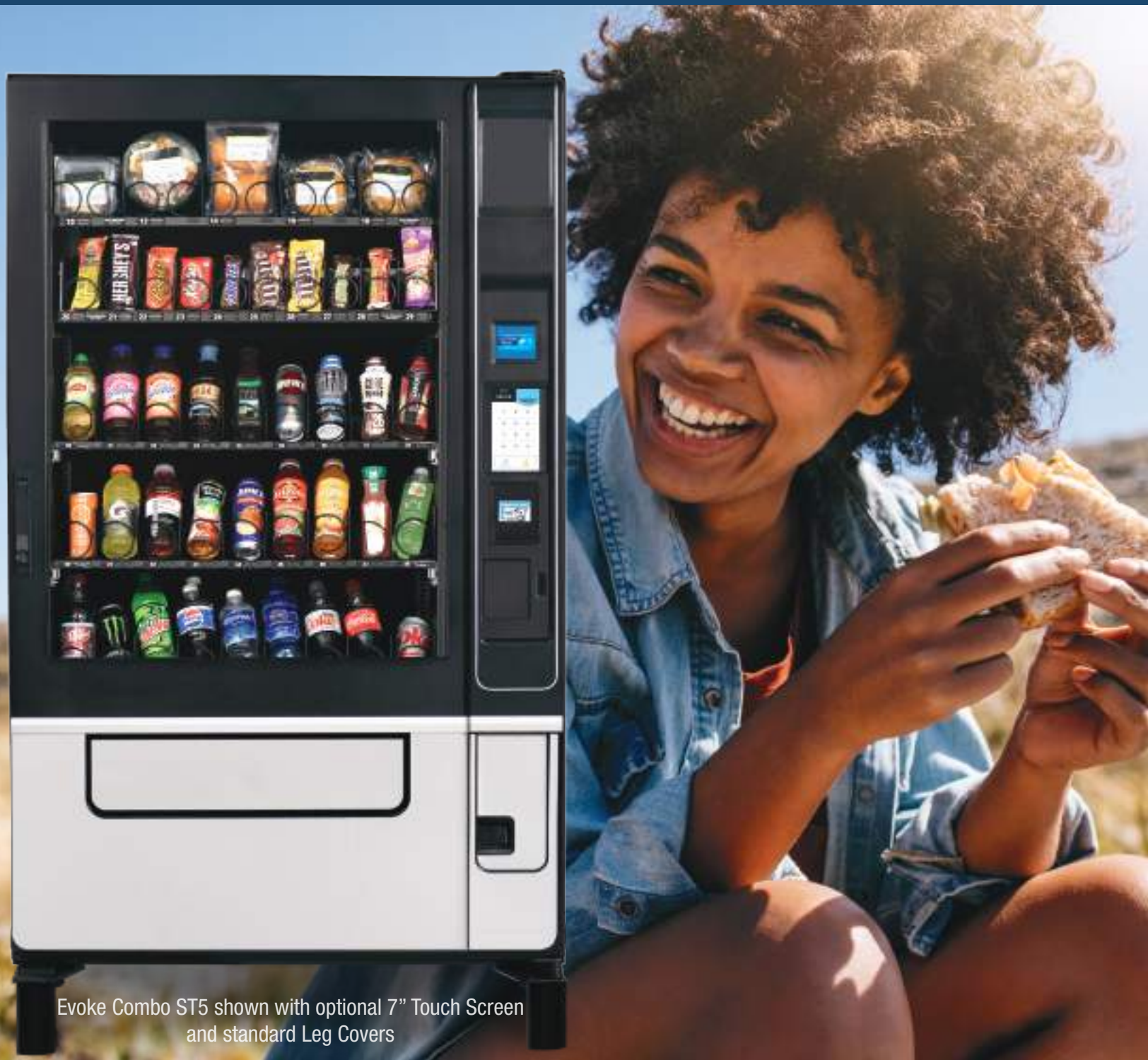
Evoke Combo ST5 shown with optional 7" Touch Screen and standard Leg Covers

The refrigerated merchandiser designed for performance and built to last