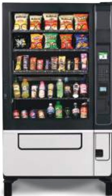
Evoke Combo VT5 shown with standard 3.5" Display, Braille Identified Keypad and Leg Covers