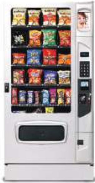
M4000 Shown with platinum door color & kick panel options.