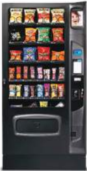
M4000 Shown with iCart touch screen & kick panel options.