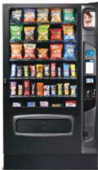
M5000 Shown with iCart touch screen & kick panel options.