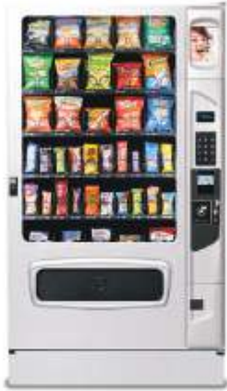
M5000 Shown with Platinum door color & kick panel options.