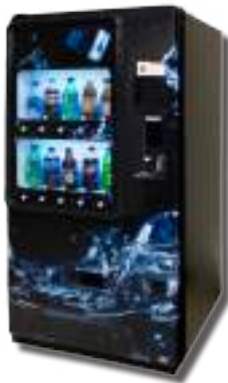
3D LIVE DISPLAY BLACK ICE