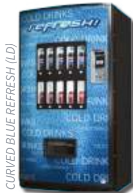
CURVED BLUE REFRESH (LD)

The classic column stack machine features flexible product loading, interchangeable control boards, self-priming vend mechanisms, energy efficiency, reliable vending, and easy servicing.