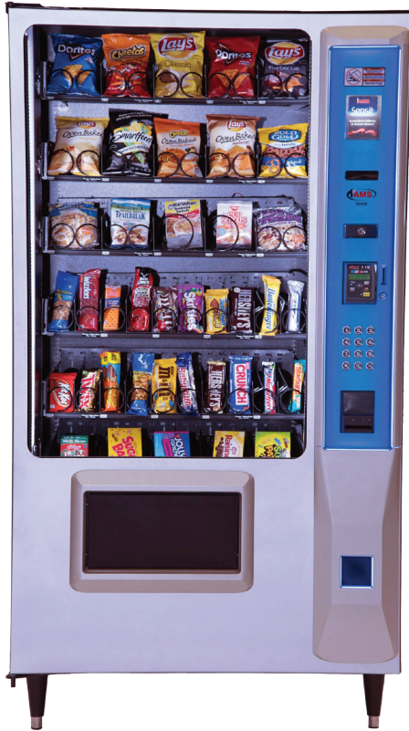
Epic Premium shown with Champagne Trim, Blue Dashboard and Cool White Lighting