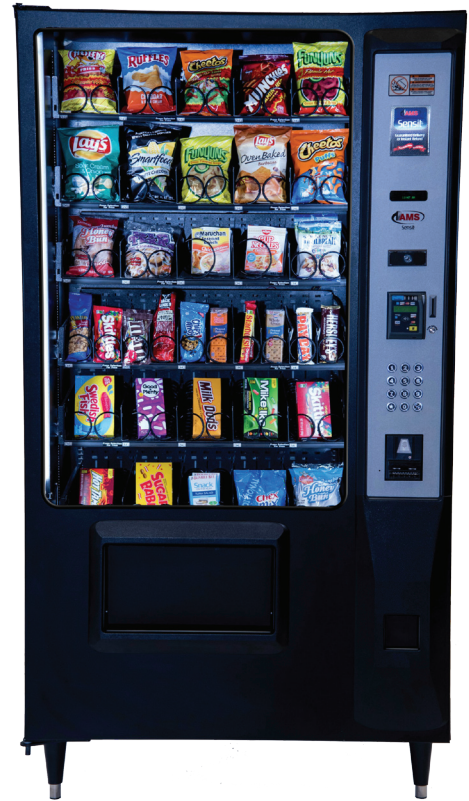
Epic shown with Black Texture Trim and Silver Dashboard