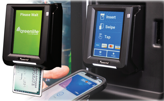
Accept Mobile Payments