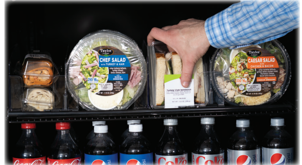
Products are Easily Accessible