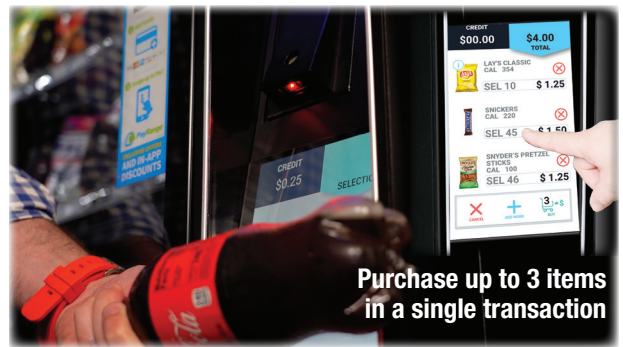
Purchase up to 3 items in a single transaction