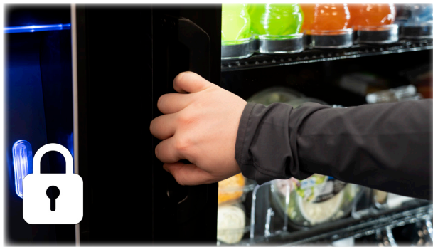
Cooler Locks for Security