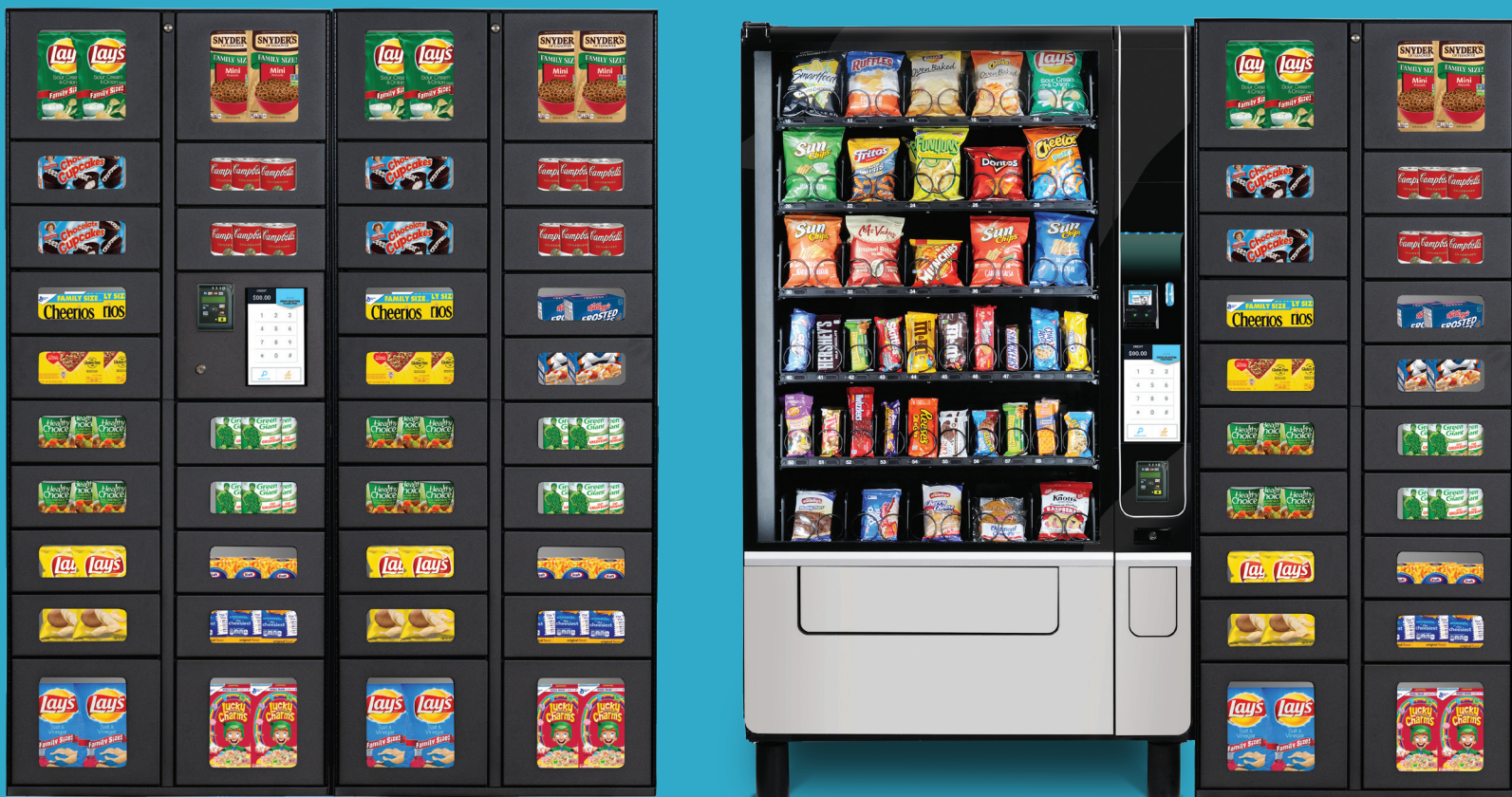
Shown with optional 10.1" Touch Screen

Retail lockers provide more capacity and more selections for larger, higher margin products.